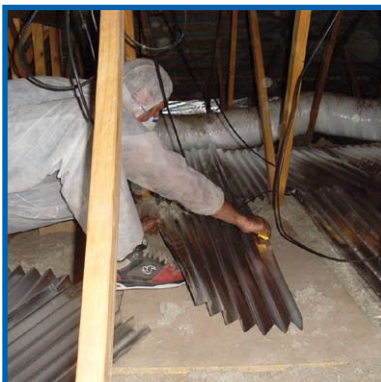
EASY DIY RETROFIT