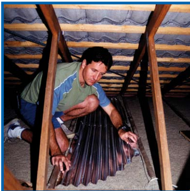
UNSTAPLED & TIMBERS VISIBLE

LAI D OVER FIBRE INSULATION – UPWARD & DOWNWARD AIRSPACES CREATED – REDUCES CEILING TEMPERATURE