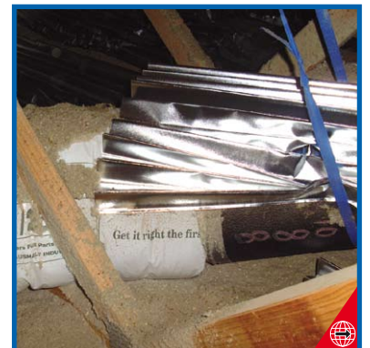
RADIANT BARRIER AROUND AIR-CONDITIONING DUCTWORK