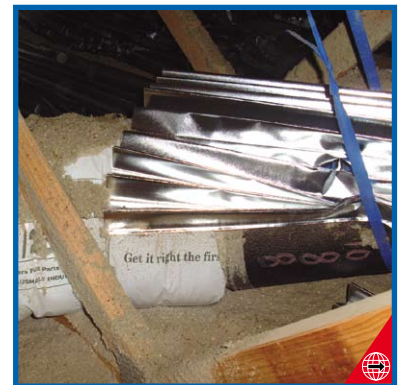
RADIANT BARRIER AROUND AIR-CONDITIONING DUCTWORK