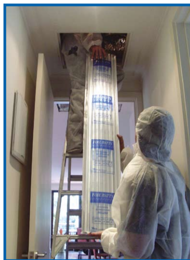
COMPACT FOR EASY HANDLING & INSTALLATION