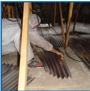
EASY DIY RETROFIT