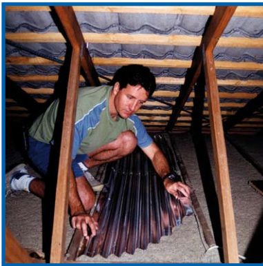
UNSTAPLED & TIMBERS VISIBLE

LAI D OVER FIBRE INSULATION – UPWARD & DOWNWARD AIRSPACES CREATED – REDUCES CEILING TEMPERATURE